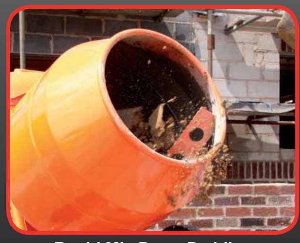
Rapid Mix Drum Paddles