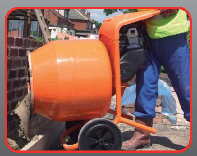
Balanced Design Ensures Control When Tipping